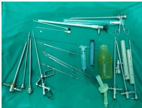
TURP set with Cystoscopy