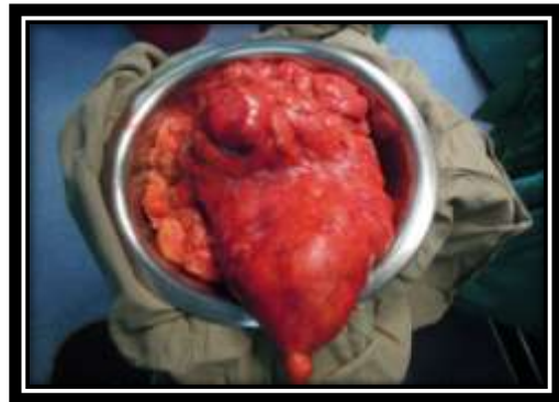
Lipo-sarcoma of thigh