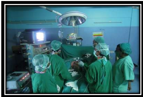
Laproscopy in progress